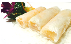
威化海鮮卷 Fried Wafer Seafood Rolls 3 pcs/件 20.4