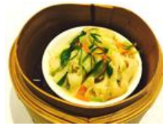
姜葱牛百叶 Steamed Beef Tripe w/ Ginger & Shallot 9.8