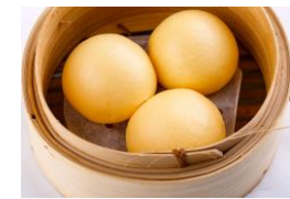
奶黃流沙包 Custard Liquid Lava Centre Buns 3 pcs/件 9.5