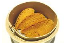
古法馬拉糕 Cantonese Steamed Sponge Cake 'Malaigao' 3 pcs/件 9.5