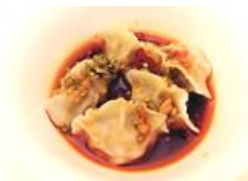
鐘水餃 Chilli Pork Wonton Dumplings 9.8