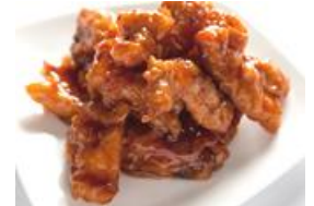
京都排骨 Pork Ribs Peking Style