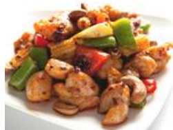
辣子雞丁 Godmother Chilli Chicken