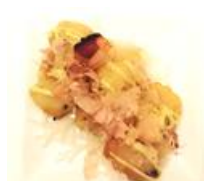
和風蘿蔔糕 Fried Radish Cake w/ Wasabi Mayo 3 pcs/件 10.0