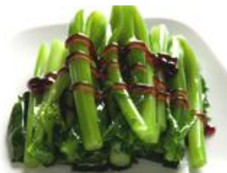
耗油芥蘭 Chinese Broccoli w/ Oyster Sauce