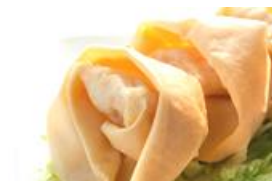
炸鮮蝦雲吞 Fried Prawn Wontons 3 pcs/件 9.8