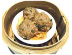
山竹牛肉球 Beef Balls w/ Water- chestnut 9.8