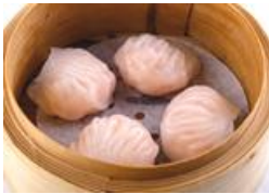
筍尖鮮蝦餃 Prawn Har Gow 4 pcs/件 11.0