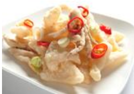
椒鹽鮮魷 Salt & Pepper Squid