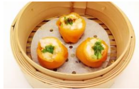
蘭粒鮮蝦餃 Prawn & Chinese Broccoli Dumplings 3 pcs/件 9.8