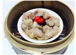
豉汁蒸排骨 Steamed Spare Ribs w/ Black Bean Sauce 9.8