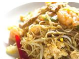
星州炒米 Fried Vermicelli in Singapore Style