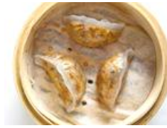
什菌水晶素餃 Mixed Mushroom Crystal Dumplings 3 pcs/件 9.8