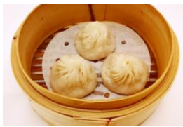
小籠包 Xiao Long Bao 3 pcs/件 9.8