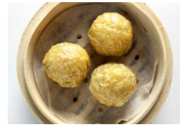
臘味糯米包 Sticky Rice Bun w/ Lap Cheong & Cured Meat 3 pcs/件 9.8