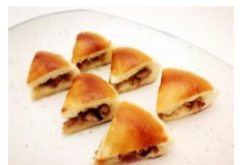
鴨肉餡餅 Pan-Fried Duck Bun 12.0