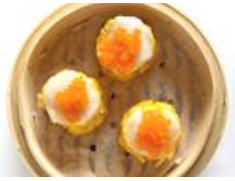
帶子蝦肉燒賣 Scallop & Prawn Siu Mai 3 pcs/件 10.8