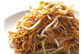
豉油皇炒麵 Fried Noodle w/ Soya Sauce