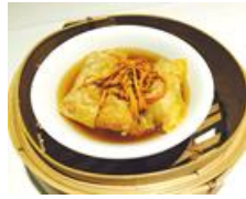
蟲草花浸鮮竹卷 Cordyceps Flower & Beancurd Rolls 10.8