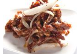
乾燒牛柳絲 Shredded Beef Peking Style