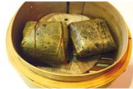
精裝珍珠雞 Sticky Rice w/ Conpoy & Abalone in Lotus Leaf 2 pcs/件 12.8