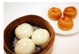
炸/蒸叉燒包 Fried (or Steamed) BBQ Pork Buns 3 pcs/件 9.5