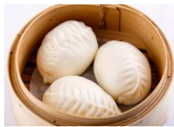
白菜豬肉包 Pork w/ Chinese Cabbage Buns 3 pcs/件 9.5