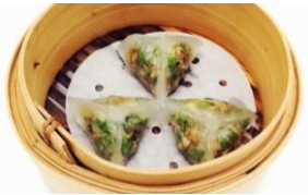
欖菜肉鬆餃 Minced Pork & Black Olives Dumplings 3 pcs/件 9.8