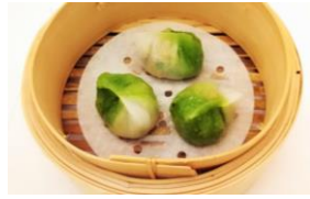
菠菜素粉果 Spinach Vegetarian Dumplings 3 pcs/件 9.8