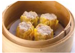
鮮肉燒賣 Plain Pork Siu Mai 4 pcs/件 9.0