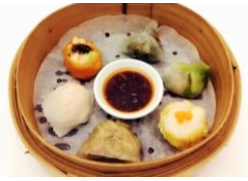
金唐薈精美點心拼盤 Signature Dim Sum Sampler Platter 6 pcs/件 20.0