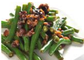
欖角肉鬆四季豆 Green Beans w/ Mince Pork & Black Olives